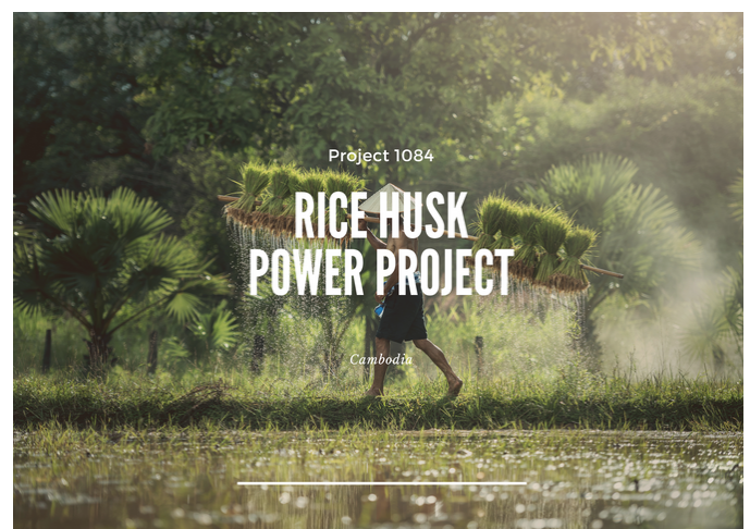
Project 1084: Rice Husk Power in Cambodia