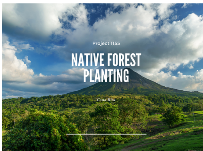
Project 1155: Forest Planting in Costa Rica