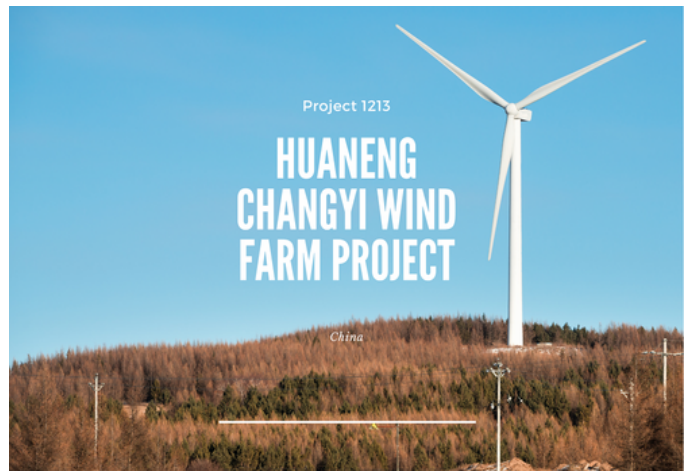
Project 1213: Wind Power in China